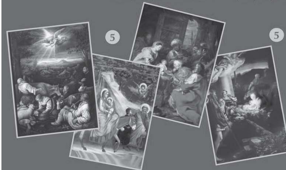
5 Assorted Package containing a selection of:

Each package contains an assortment of 10 quality Classic Art Christmas Cards & Envelopes.