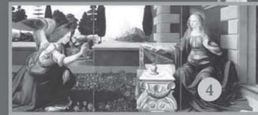
4 Annunciation Leonardo da Vinci c. 1472