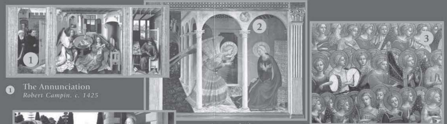
1 The Annunciation Robert Campin. c. 1425

Packages # 1, 2, & 4 contain 15 quality Tri-fold Classic Art Christmas Cards & Envelopes. Package # 3 contains 20 quality Half fold Classic Art Christmas Cards & Envelopes